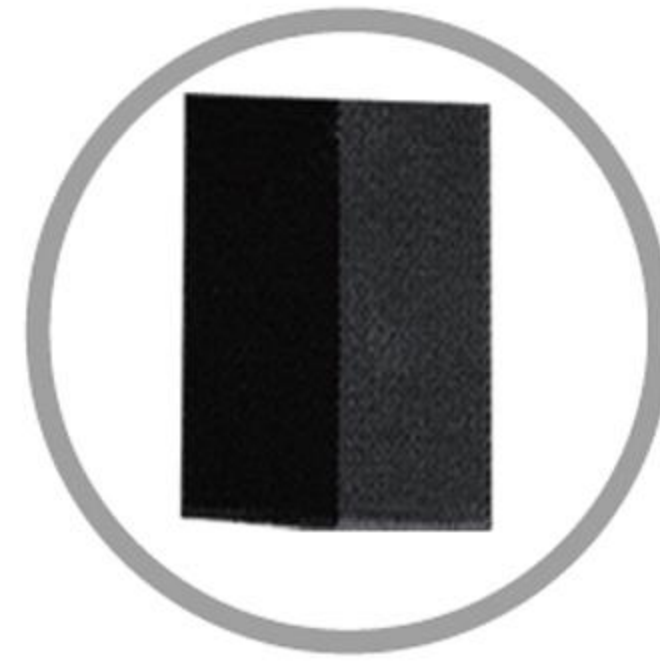
HD2268A 所切产品 HD2268A Cutting Sample

标准型 Standard 色标感应Logo Sensor detect logo