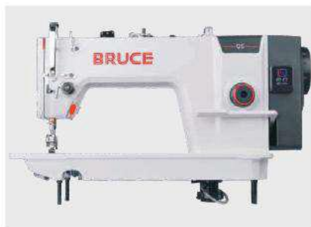
德国工艺，稳定耐用 German technology, stable and durable