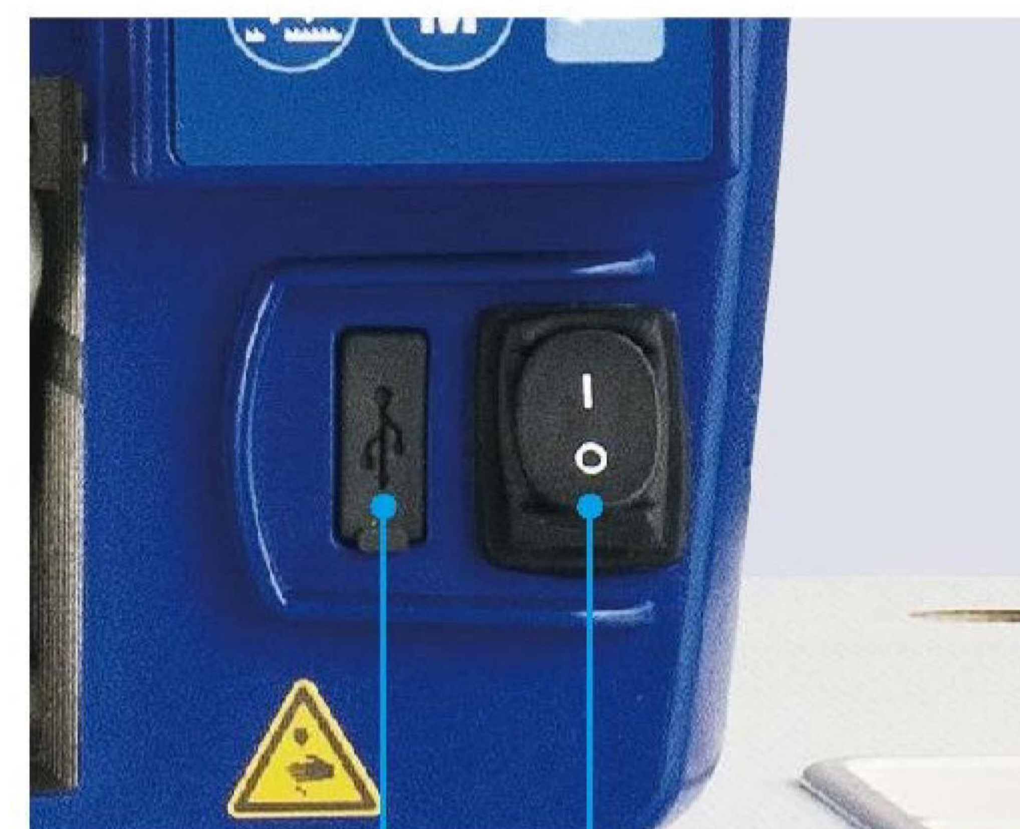
USB port — power switch

The operation panel is equipped with ease with many different functions.