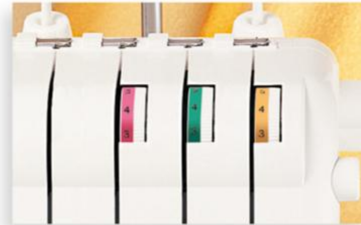
Built-in tension adjusting device