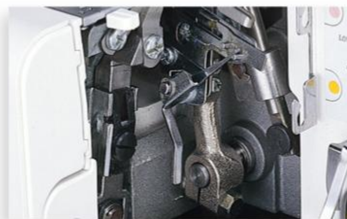
Auto looper threader