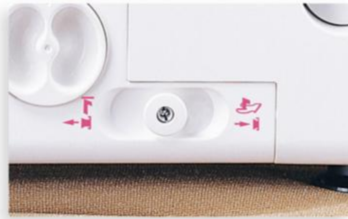
Built-in upper knife clutch device