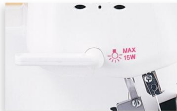
Built-in sewing lamp