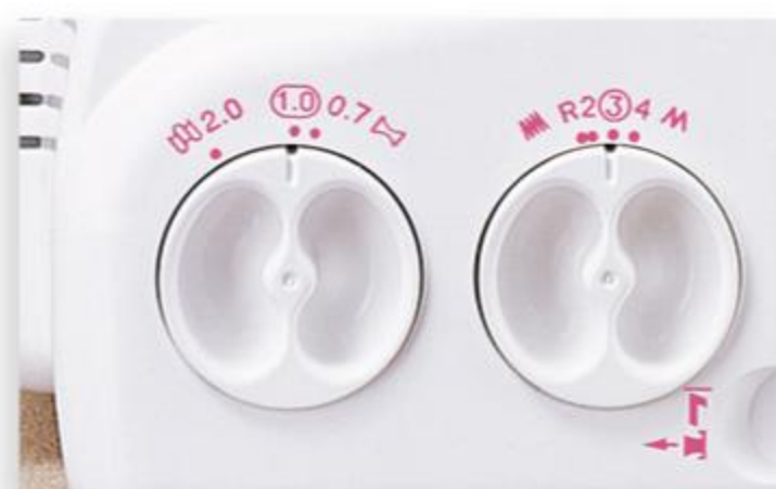
Differential and stitch length knobs