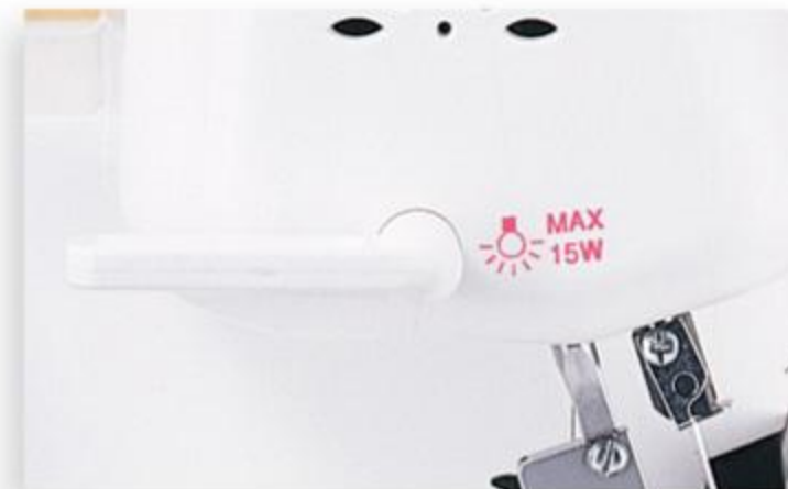
Built-in sewing lamp