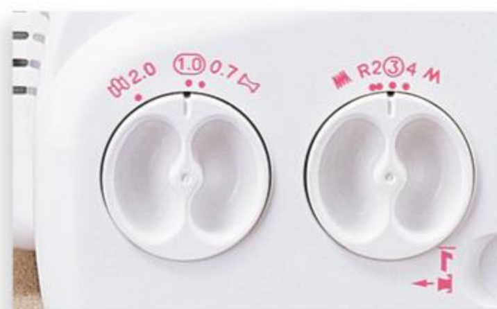
Differential and stitch length knobs