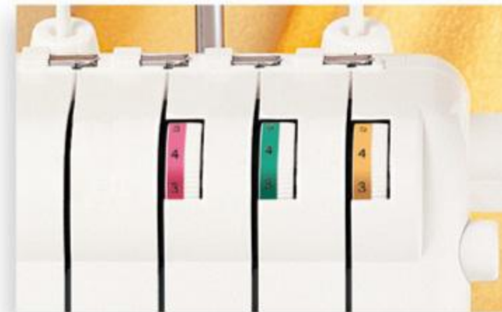
Built-in tension adjusting device