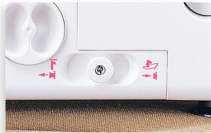
Built-in upper knife clutch device